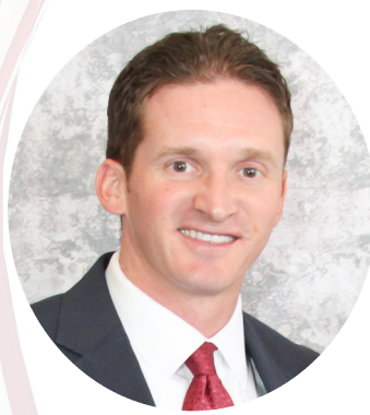
Dane Eagle Florida House of Representatives