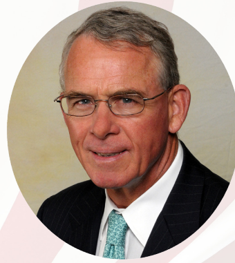
Francis Rooney Candidate Florida State Senate