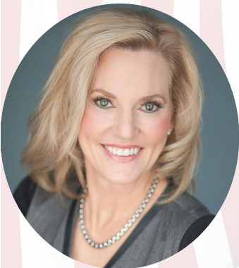
Heather Fitzenhagen Florida House of Representatives