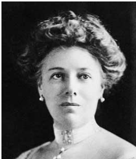
Helen Louise "Nellie" Herron Taft 1861-1942